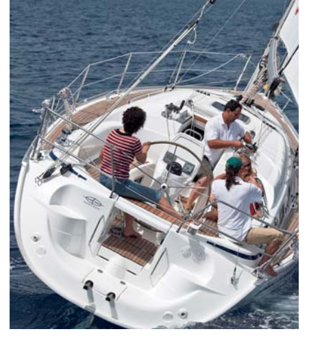
• Steering pedestal with single lever engine controls