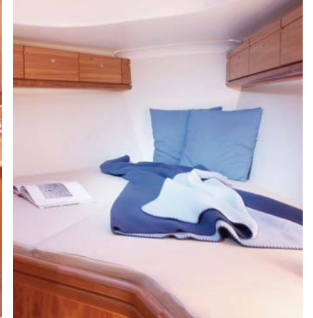
• Two cabins with double berths and enclosed lockers