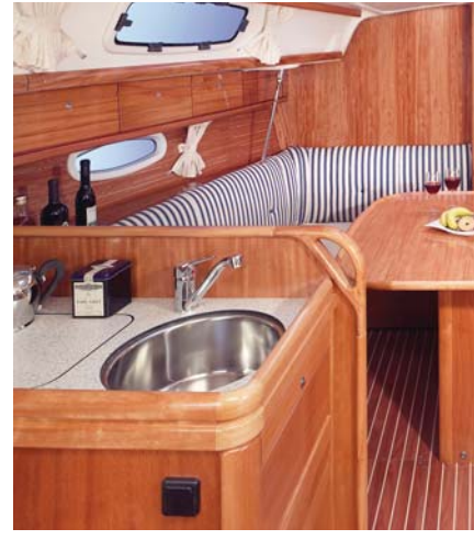
• Salon with settee and large mahogany table

A fuller hull shape allows for increased interior volume, while two fixed hull ports and two skylights aft of the mast accentuate the lighter mahogany interior wood finish. Multiple opening ports and hatches supply ample cross ventilation.