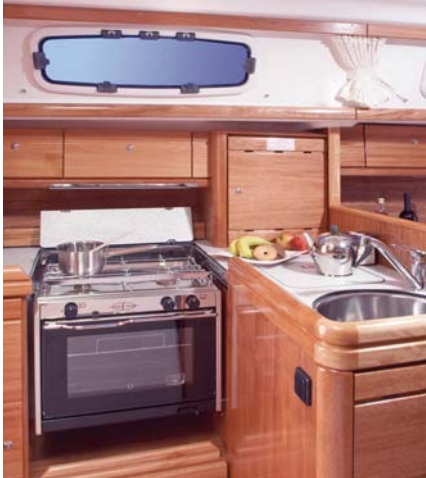
• L-shaped galley with ample stowage for dishes and provisions